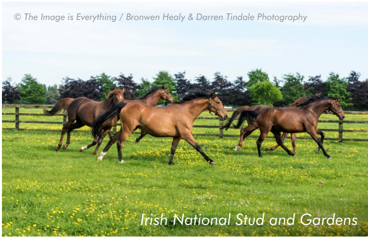
Irish National Stud and Gardens