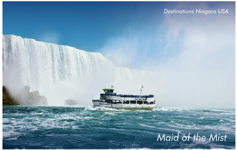
Destinations Niagara USA