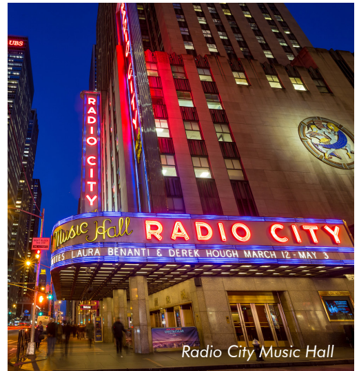
Radio City Music Hall