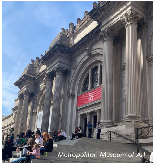
Metropolitan Museum of Art